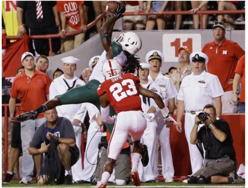
Above: Nebraska vs. Miami (Sept 2014)