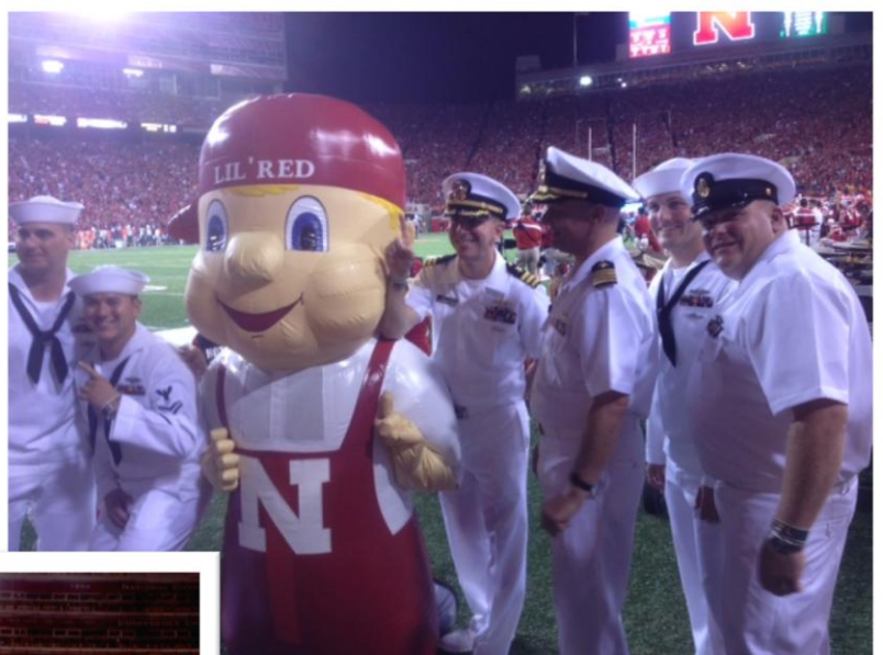
Above: "Lil' Red" and crew at the Husker Game.