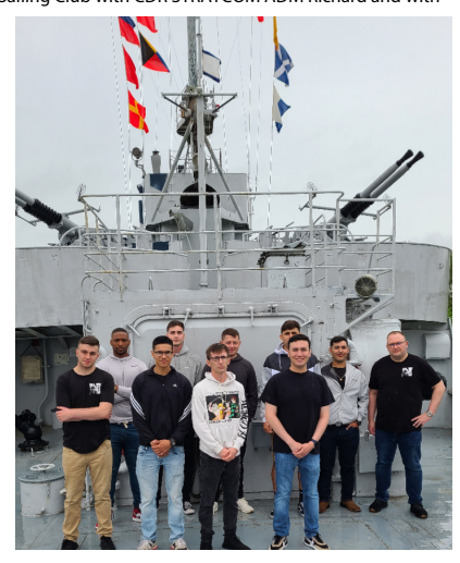
Visiting on board the USS HAZARD along with USS OMAHA crew.