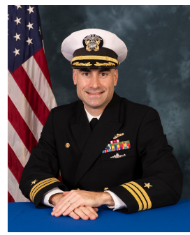
COMMANDER JOSHUA P CORBIN UNITED STATES NAVY